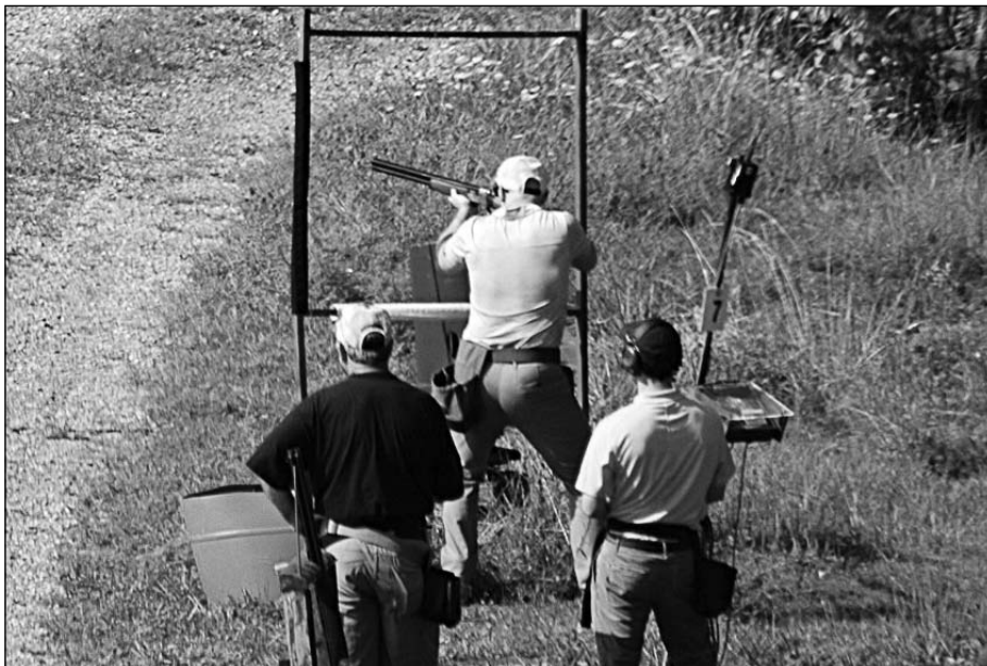
Shooters participate in the Parkersburg-Marietta Building Trades annual DAD's Day Sporting Clay Shoot Fundraiser at Hilltop Sports in Whipple, OH.

Non-Profit Org. U.S. Postage PAID Permit # 1374 Charleston, WV 25301