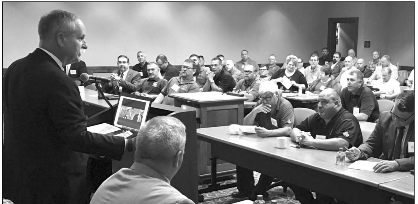
Congressman David McKinley speaks to delegates at the annual WV State Building Trades Convention held on September 8.