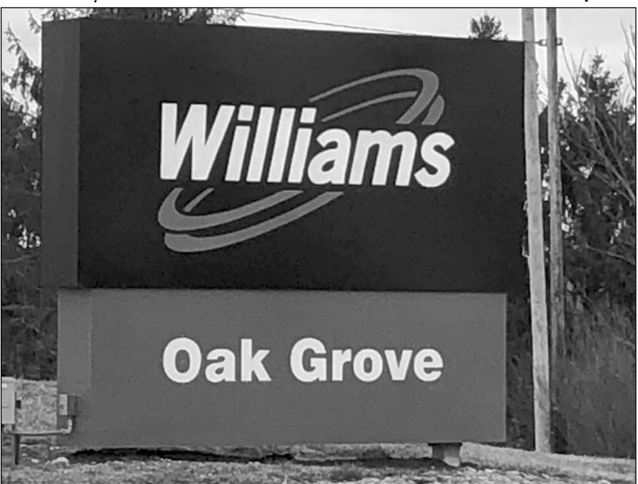
Two workers fled this Moundsville project site when the WV Fire Marshal's office showed up to check electricians licenses on November 5. Court records show three people were cited for not having a West Virginia electrician's license during the inspection. MMR Constructors Inc. from Baton Rouge, Louisiana is the main electrical contractor.