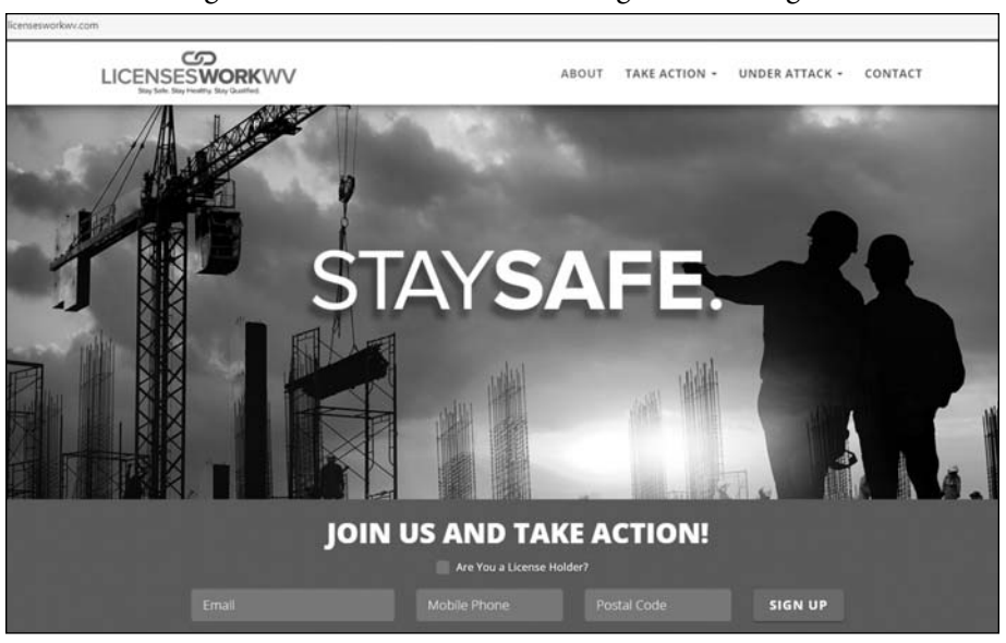
This screenshot of the new 'Licenses Work WV' website shows how you can stay updated on licensing issues. Log onto www.licensesworkwv.com, and find it on Facebook & Twitter under 'Licenses Work WV.'

Members of the Charleston Building Trades have volunteered with the Salvation Army for their annual Christmas fund drive every year for decades.