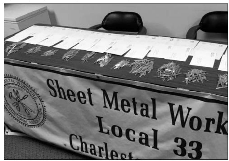
Piles of aluminum nose bridges are ready to ship from the Charleston District of Sheet Metal Workers Local 33.

Other WV affiliates, SMW 24 and SMW 100 have also been participating in the effort. ■