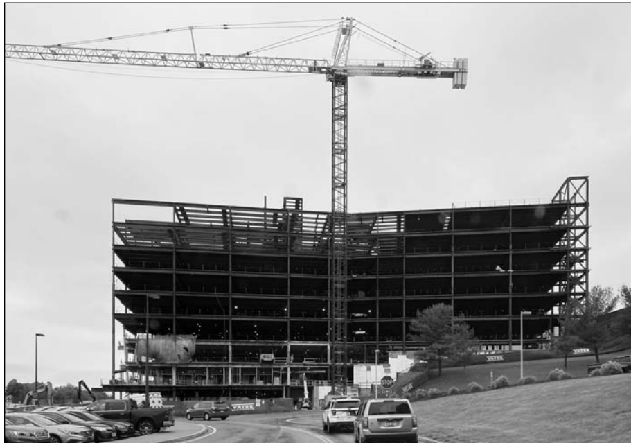
Local union construction workers are building the nine-story WVU Women & Children's Hospital in Morgantown, which is boosting the local economy.