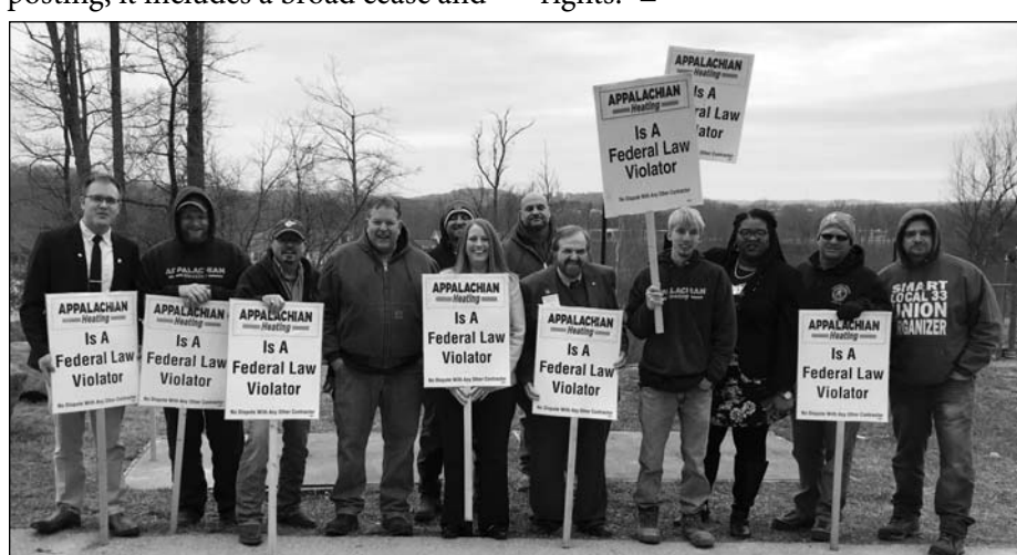
Workers at Appalachian Heating are joined on the picket line in Charleston by legislators and Local 33 Representatives during a two-week strike over unfair labor practices in February 2019.

"The Respondent's aggressive, broad, and unlawful effort to undermine the union only grew more egregious over time and demonstrated a general disregard for employee rights."