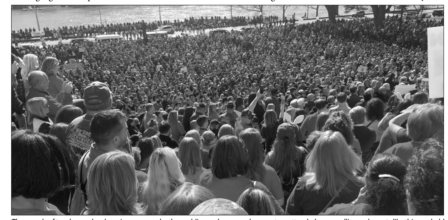
Thousands of teachers, school service personnel, other public employees and supporters attended many rallies and events like this one held on the steps of the state Capitol on Monday, February 26.