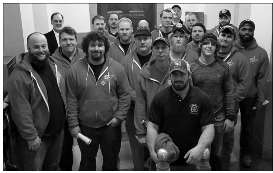
Members of the construction trades, like this group of IBEW members from Local 466 Charleston and Carpenters from the KML Regional Council, came to the Capitol throughout the session to let legislators know they wanted to protect the WV Jobs Act.

Non-Profit Org. PAID Permit # 1374 rleston, WV 2530