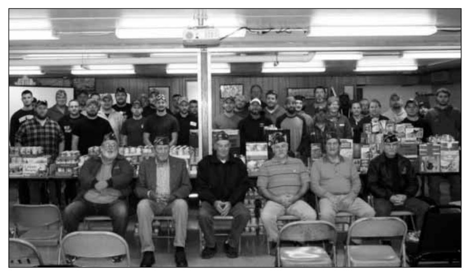
Apprentices from Plumbers & Pipefitters Local 625 in Charleston stand behind piles of food supplies while members of VFW Post #4768 sit in front.