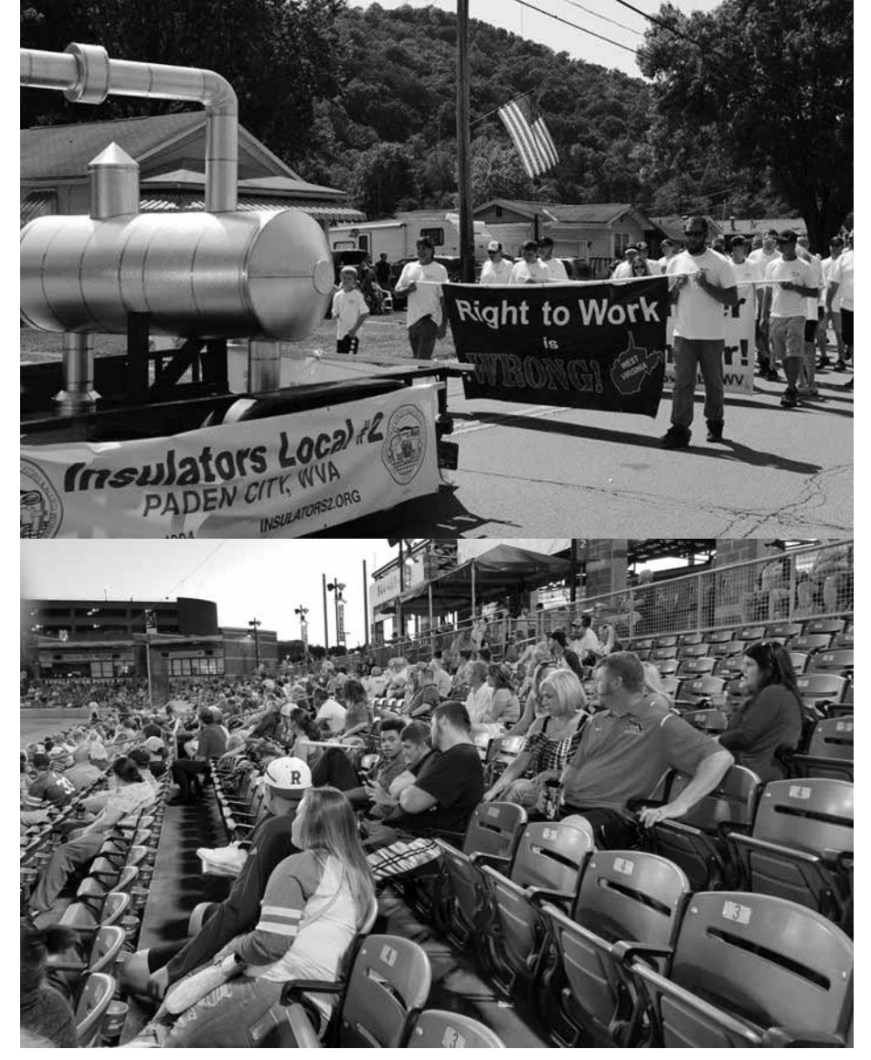
Labor Day weekends events across the state included (top) a large group from Insulators Local 2 joined in the annual Paden City Labor Day Parade. The event attracts a large crowd and participation from all of the crafts.

However when a company representative from Kinder Morgan was asked the same question he said