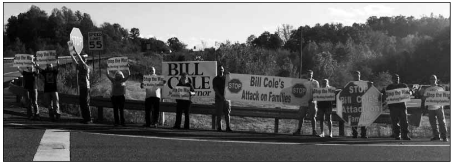
Members of the Parkersburg Labor Council stage a protest at a Bill Cole for Governor rally in Mineral Wells in mid-October.