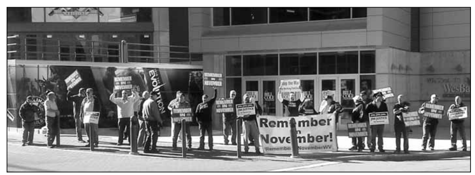
In the final days before the election Trades members hit the street before a Bill Cole for Governor function in downtown Wheeling.