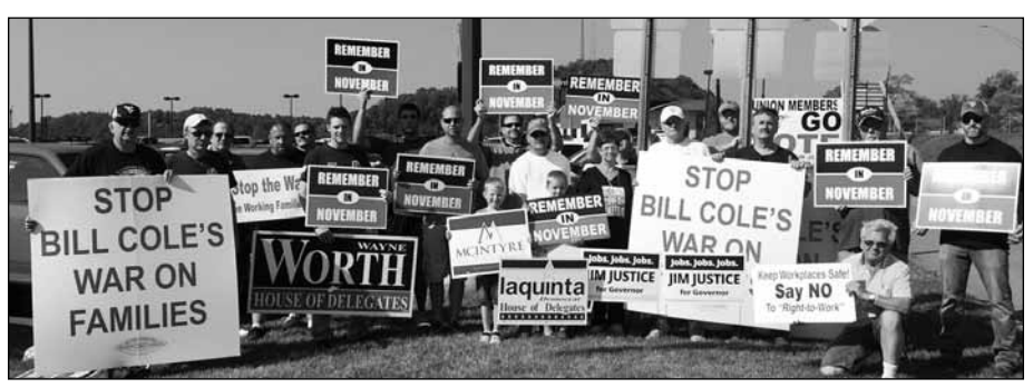
Members of the North Central WV Building Trades let passing motorists know about how important the election is at a "honk and wave" in Clarksburg.