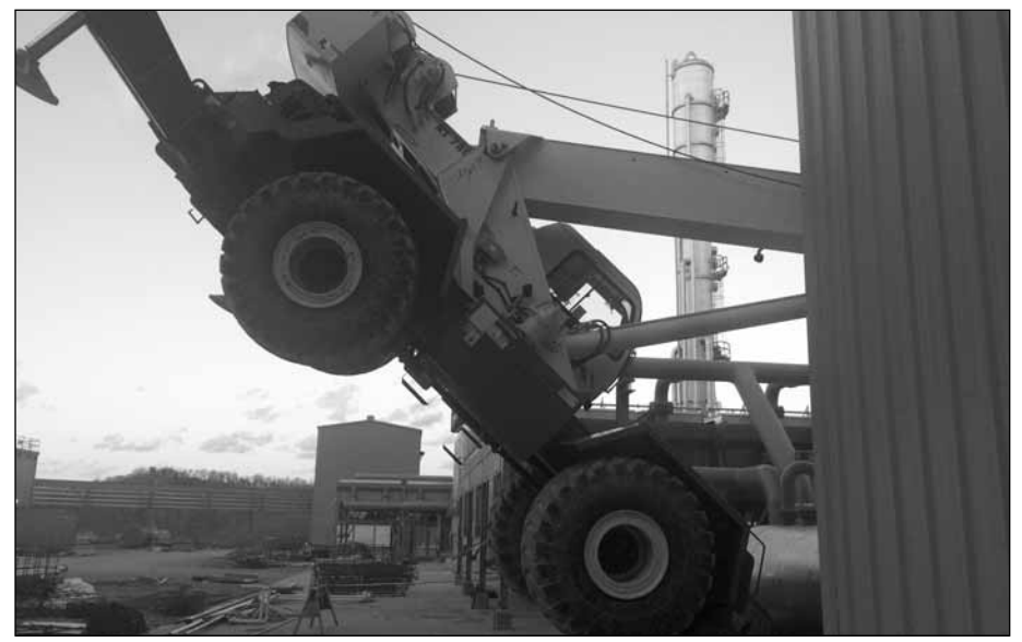
This toppled crane at MarkWest's Mobley site in Wetzel County was mentioned in MarkWest lawsuit against Westcon. The suit alleges "a month after the crane incident, Westcon again disregarded MarkWest's specific instructions ... and improperly utilized a mobile fork lift [which] led to a serious incident where equipment struck a valve on the operating gas line...".

"O'Donnell Consulting Engi-Cont. on p. 4>>