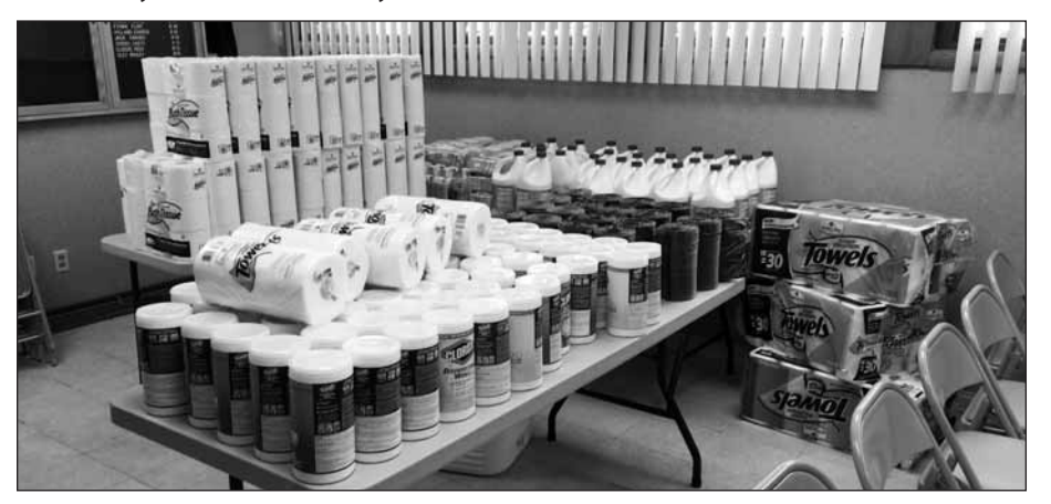
The WV Laborers' DC contributed $10,000 to the disaster relief fund set up by the WV AFL-CIO and $10,000 to a relief fund set up by the Southeastern Central Labor Council. Local 1353 purchased cleaning supplies for effected members.