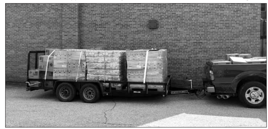
A trailer full of supplies donated by Operating Engineers 132 is part of approximately $10,000 in supplies to various communities in Southern West Virginia.