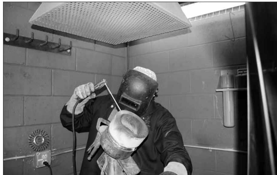
A fifth year apprentice welding during the State Pipe Trades apprenticeship contest in Wheeling.

Wheeling's Local 83 is slated to hold the state apprenticeship contest again next year. ■