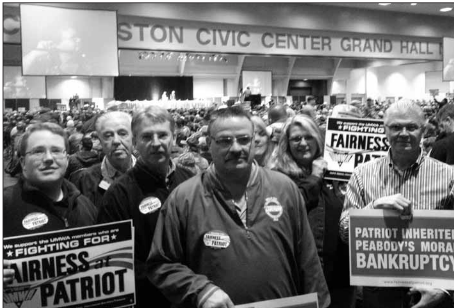
Members of the Laborers join other union workers at a UMWA rally held in Charleston earlier this year to protest Patriot Coal's bankruptcy plan.