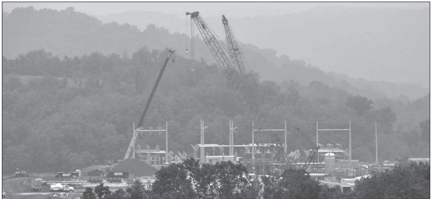
Williams Partners has hired union contractor URS to build this natural gas processing facility at Oak Grove, in the Wheeling area. This project employs hundreds of local union construction workers and is one of several natural gas processing facilities under construction to meet the needs of Marcellus and Utica Shale gas.