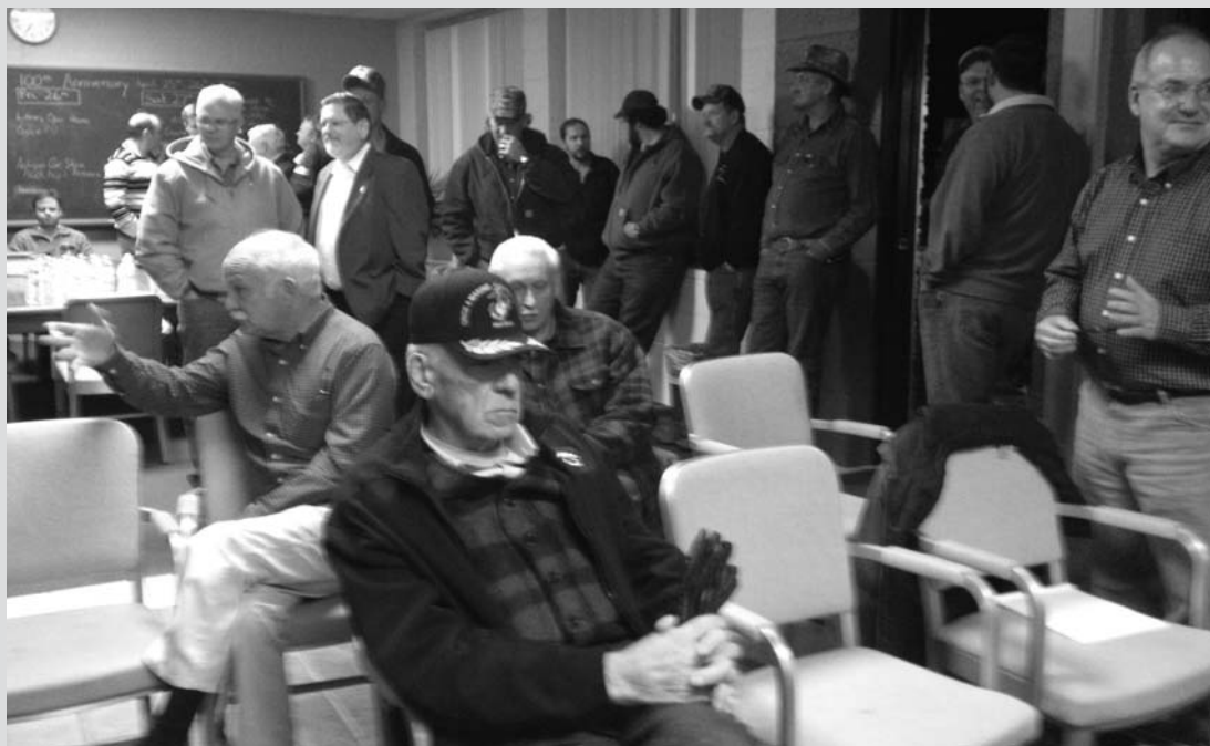
Members of the Carpenters, Operating Engineers and Laborers showed up in support of the Beech Ridge Wind project in Greenbrier County. The addition of 30 new wind turbines is being proposed. The event was a public hearing held by the WV Public Service Commission at the Rainelle City Hall the evening of Thursday, January 10.