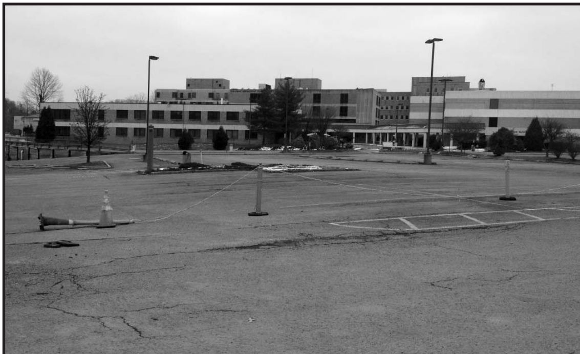
THE FORMER UNITED Hospital Center located in Clarksburg is being transformed - by local union workers - into the new Highland Hospital. Work starts in late January and should complete in early 2014.

local community and to using local labor to build their projects,” said Stone.