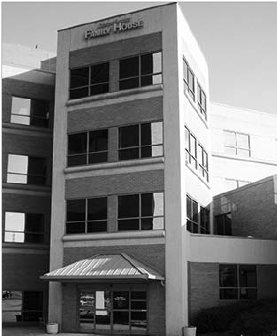
Once the new Family House is built the existing family house pictured here will be torn down to make way for a new $280 million expansion of the Ruby/WVU Children's Hospital complex.

Non-Profit Org. U.S. Postage PAID Permit # 1374 Charleston, WV 25301