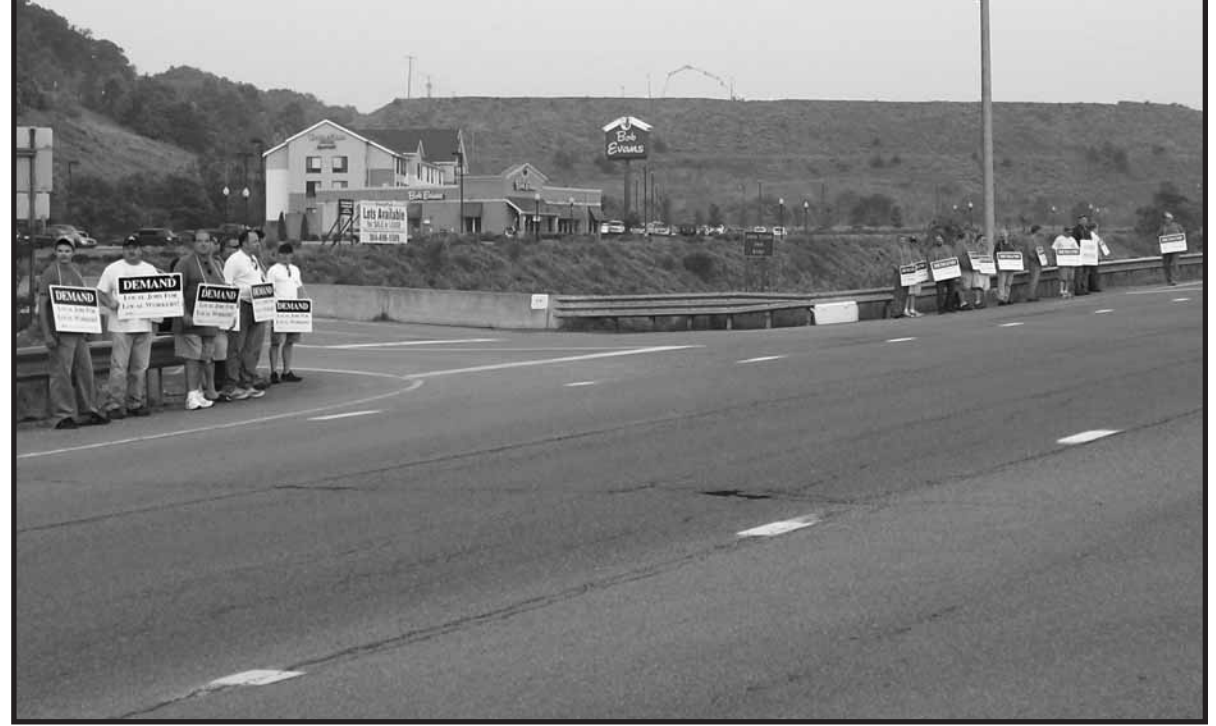
PROTESTING LOST CONSTRUCTION jobs at the Amazon.com project in Huntington were around 40 local workers from a variety of crafts. The action took place on Friday, June 10 and continued the following week.