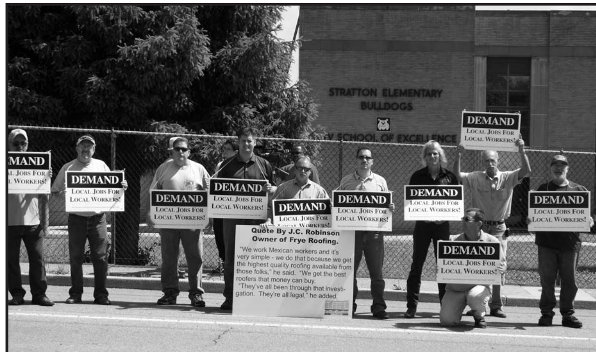
PROTESTING THE USE of out-of-state workers are members of the Roofers, Carpenters, Sheetmetal Workers, Electricians and Ironworkers.

Payroll records revealed Continued on p. 4