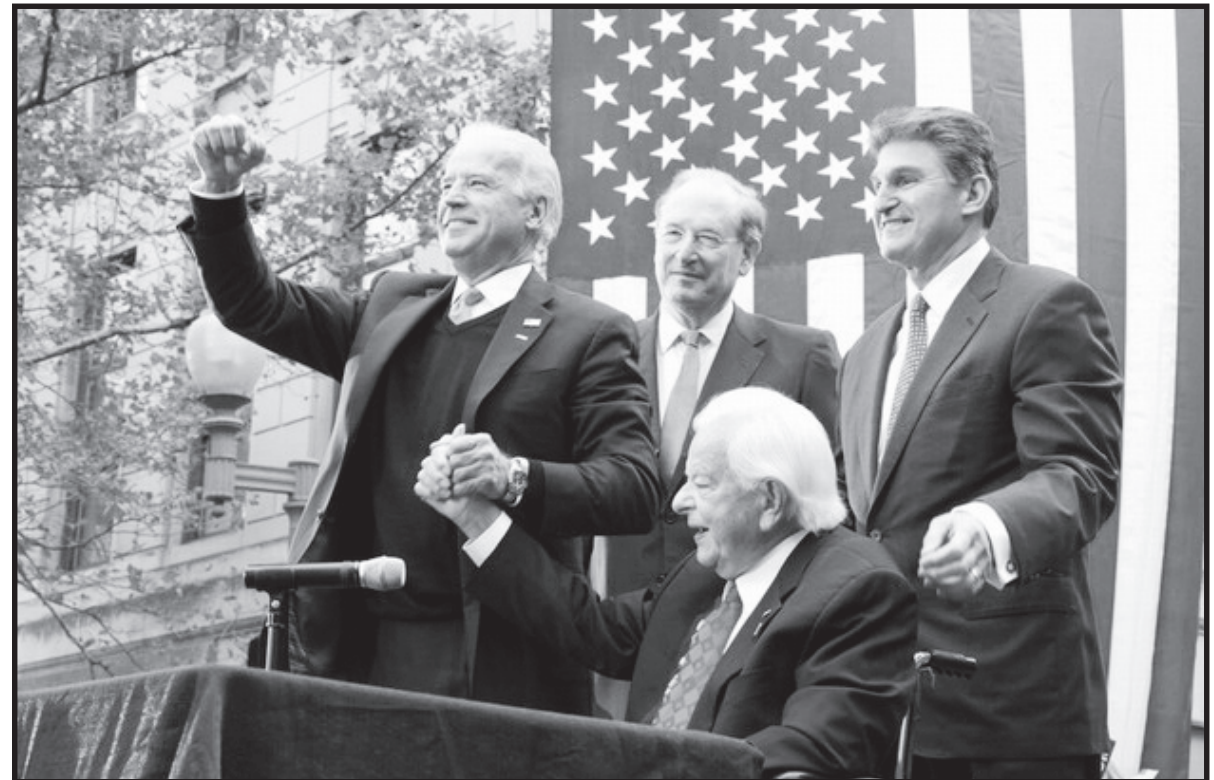
SENATOR JOE BIDEN addressed a Charleston crowd at a rally prior to the election along with Senators Jay Rockefeller and Robert C. Byrd as well as Governor Joe Manchin.

Overall the WV AFL-CIO figured 83% of endorsed candidates won.