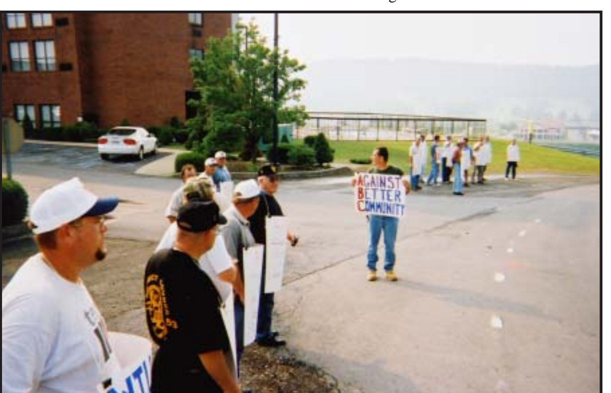
PROTESTING IN FRONT of the ABC's annual convention site in Flatwoods are more than 20 workers from across the state.

And the ABC itself is feeling the heat. At their recent annual convention workers were out