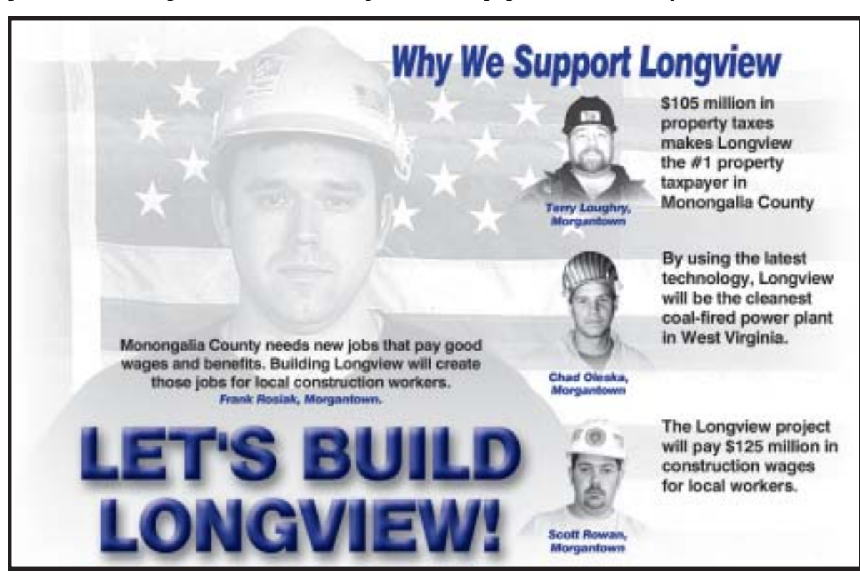
THIS POSTCARD WAS SENT to every household in Monongalia County with a registered voter. Local construction workers want their voices heard in the debate about the $950 million Longview project.