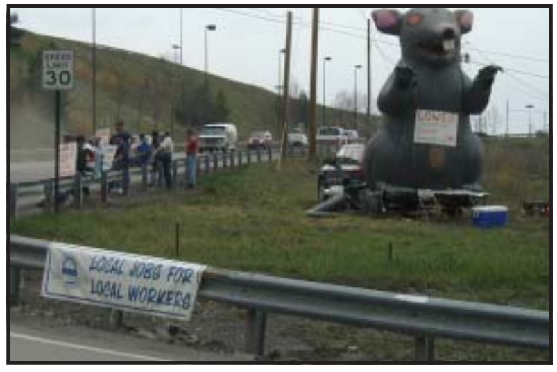
NORTH CENTRAL WEST VIRGINIA Building Trades members stage a "Local Jobs for Local Workers" rally near a Lowes construction site in Morgantown.

The North Central West Virginia Building Trades wants the public in Morgantown to know about it, too. On April 3 and 4 the council organized an