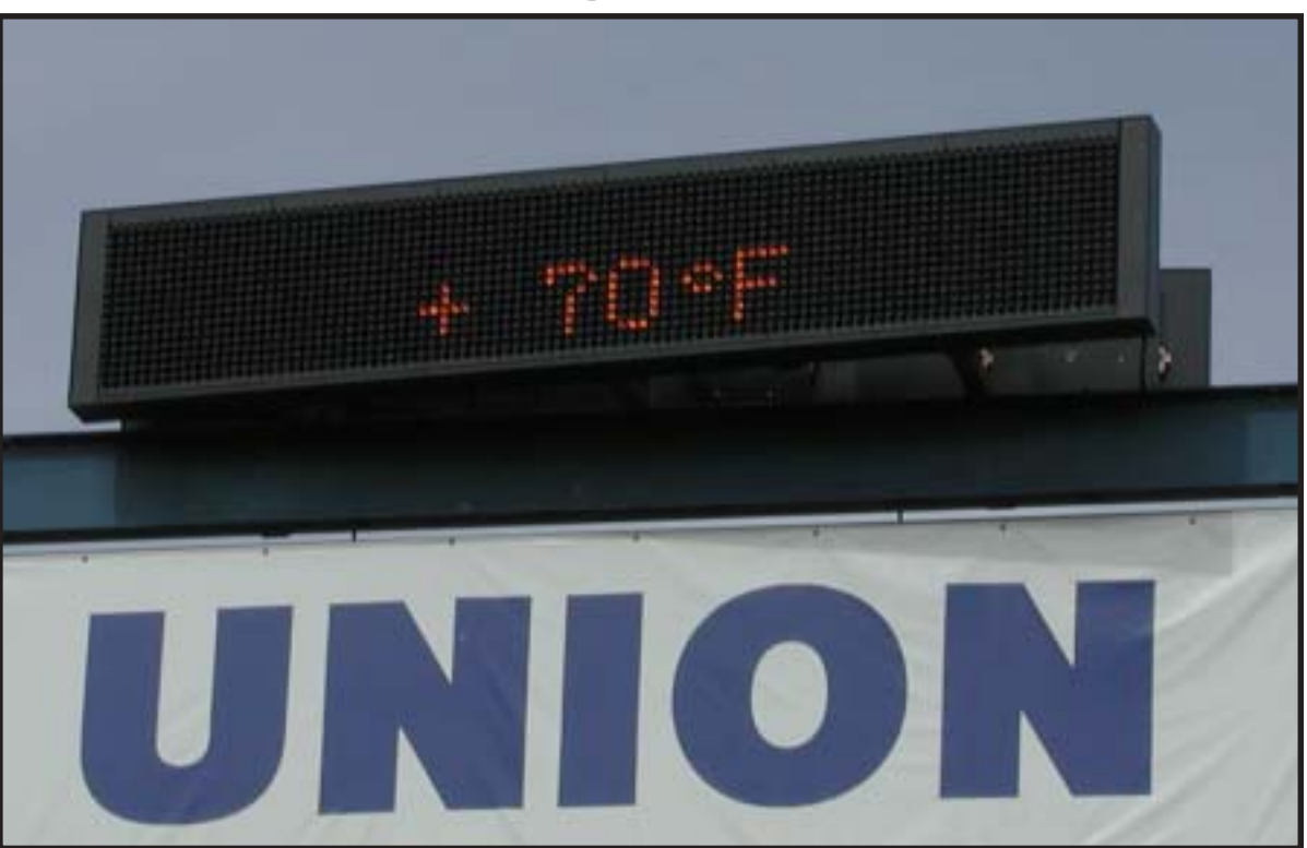
GETTING THE MESSAGE OUT is what ACT is all about. This new electronic, scrolling, 2-sided sign located just inside the Parkersburg city limits gives motorists on Route 95 important messages. The billboard tower is owned by the Parkersburg-Marietta Building Trades. The site is donated by Millwrights Local 1755.