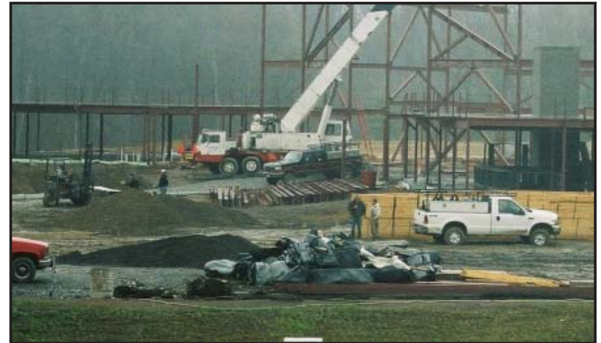
RALEIGH MINE AND INDUSTRIAL SUPPLY performs steel erection at the Beckley Church of God. The company is currently under investigation by the DOL.

Raleigh Mine and Industrial Supply is the parent company Continued on p. 4