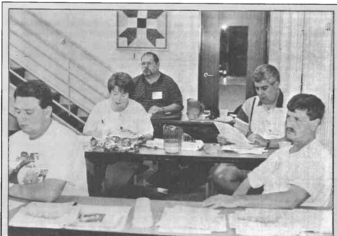
PROTESTING UNFAIR LABOR PRACTICES by B.F. Foster Co. are members of Operating Engineers Local 132 and Laborers Local 1353, near the Elk Two-Mile Watershed Project in Kanawha County.