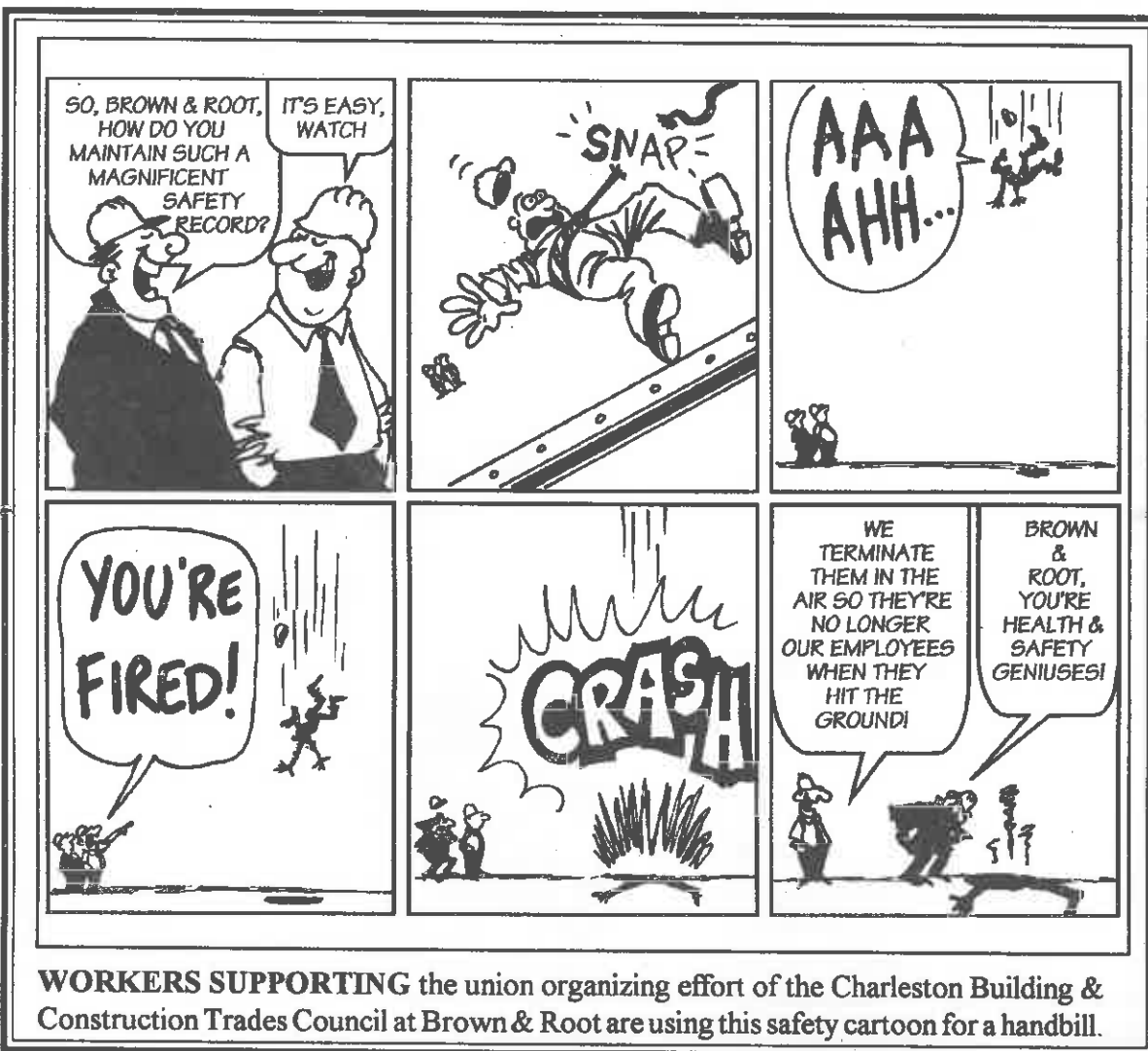
WORKERS SUPPORTING the union organizing effort of the Charleston Building & Construction Trades Council at Brown & Root are using this safety cartoon for a handbill.